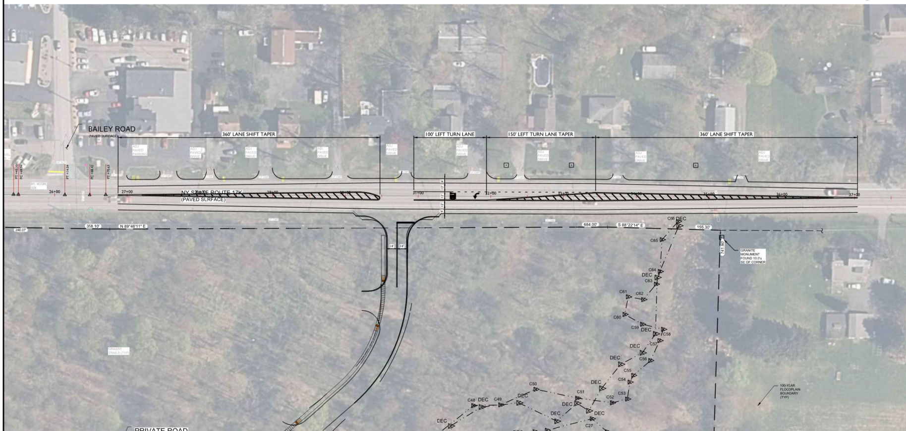
DEIS Figure 3.8B